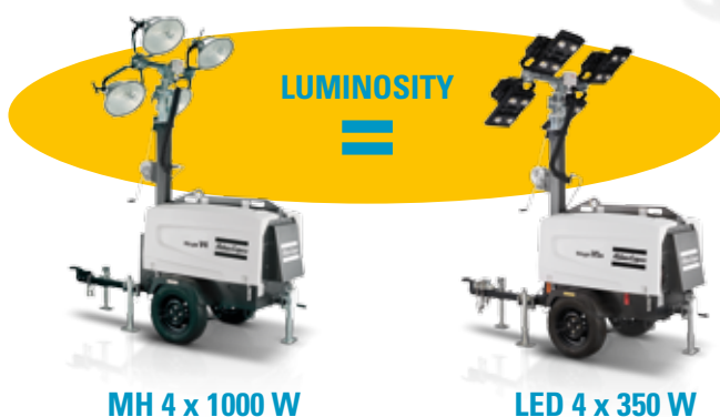
MH 4 x 1000 W