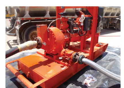
High Head Pumps for Temp Fire and Cleaning