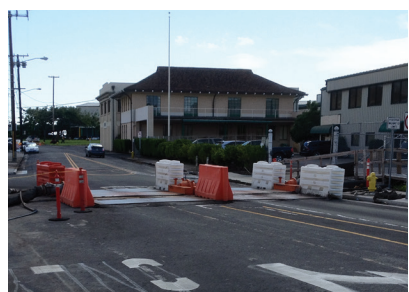
Flanged Road Crossings in a Range of Sizes