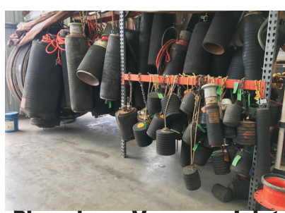
Pipe plugs, Vacuum, Joint & Mandrel Testers