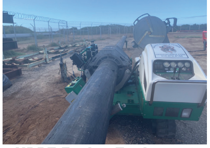
HDPE Fusion Equipment and Training